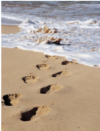
Your footprints are made from here

Such “clubs” were the source of inspiration for great champions of liberty such as Adam Smith, Ludwig von Mises, Friedrich Hayek, Voltaire, and others to be found in our midst today.